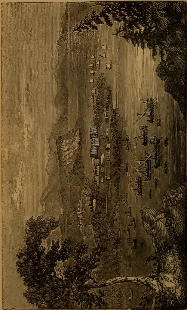
THE PIRATES AT ANCHOR.